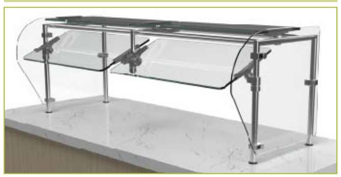
To meet NSF guidelines, end panels are included on all BSI quotations unless specifically excluded. (See End Panel Page for More Details.)

Self Serve w/Top Shelf, U-Shaped End Posts w/ Shortened Center Post